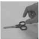
Normally we pretend as a invisible observer.

Actor network theory (ANT), also known as enrolment theory or the sociology of translation. Stemming from a Science and Technologies Studies (STS) interest in the elevated status of scientific knowledge and counter to heroic accounts or innovation models, ANT suggests that the work of science is not fundamentally different from other social activities.