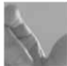
Now, we are in the eye of the object.

Transforming the frame of the reference.