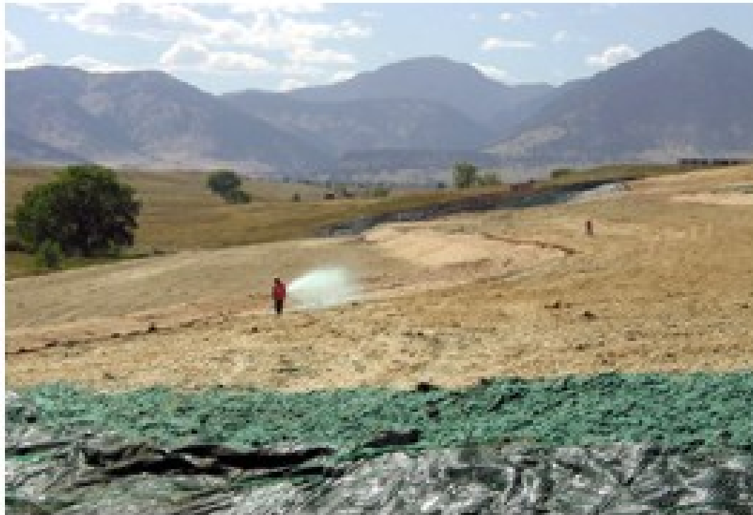
Seeding the original landfill at the Rocky Flats