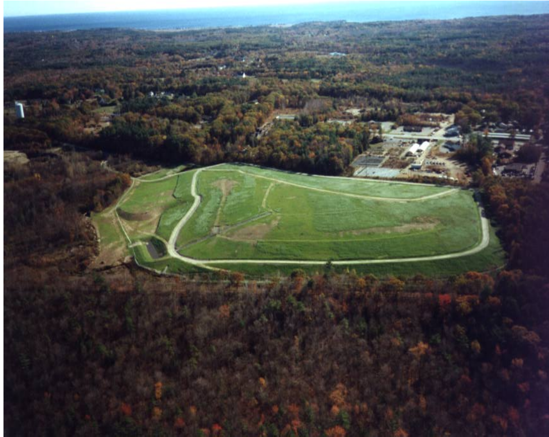
Final Landfill Cap at Coakley Lanfill Site